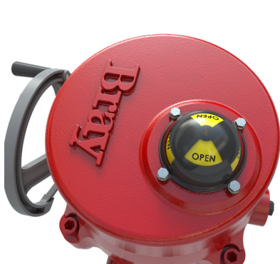
Figure 1: Sizes 1-4, and Size 6.