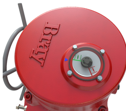
Figure 2: Sizes 5 & 7.