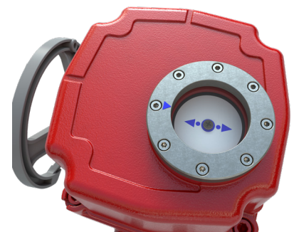
Figure 3: Sizes 1-5.